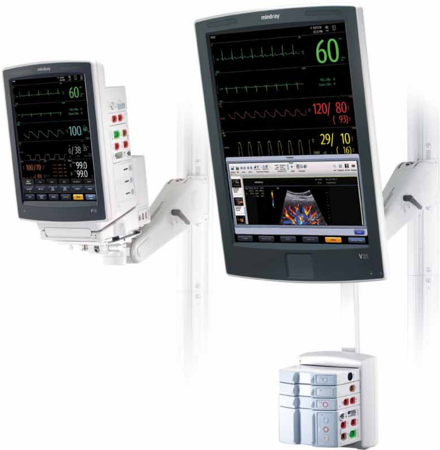
Available in two color TFT touchscreen display sizes: V 12 and V 21