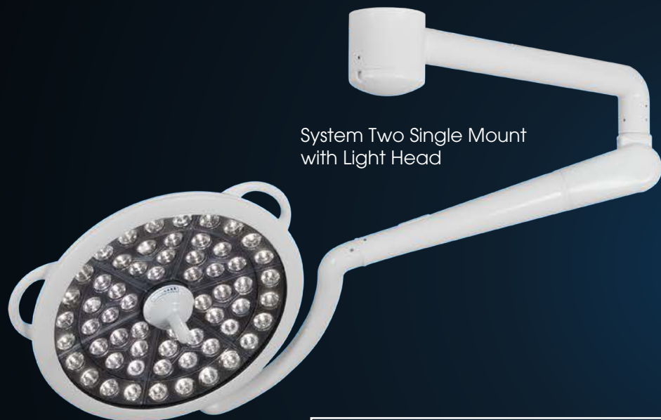
System Two Single Mount with Light Head

The System Two comes in single, dual and triple mounts with one, two or three light or accessory options. Choose the best configuration to fit your operating rooms.