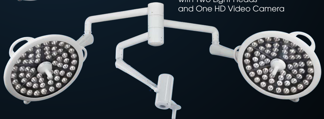
System Two Triple Mount with Two Light Heads and One HD Video Camera