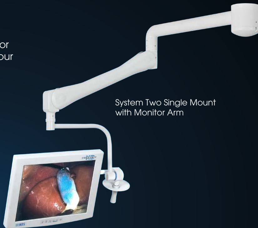
System Two Single Mount with Monitor Arm