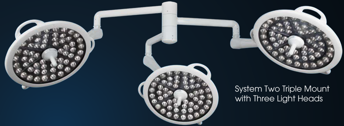
System Two Triple Mount with Three Light Heads

The Triple Mount represents the ultimate flexibility in the surgery room. Configurations include three light heads, two light heads with video monitor arm, or video camera with two light heads. Complete surgery lighting and video capability with superb performance.