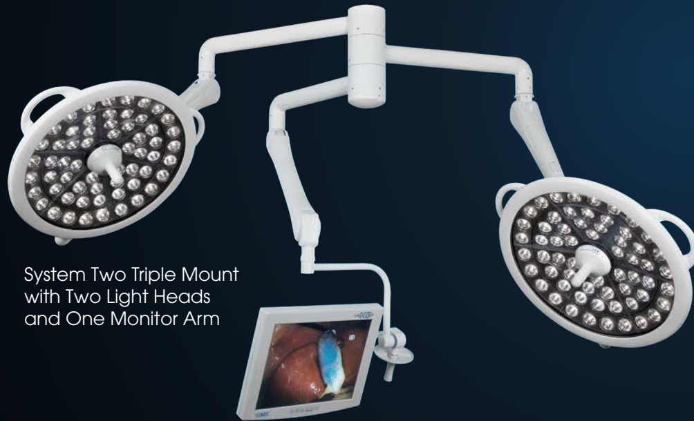
System Two Triple Mount with Two Light Heads and One Monitor Arm