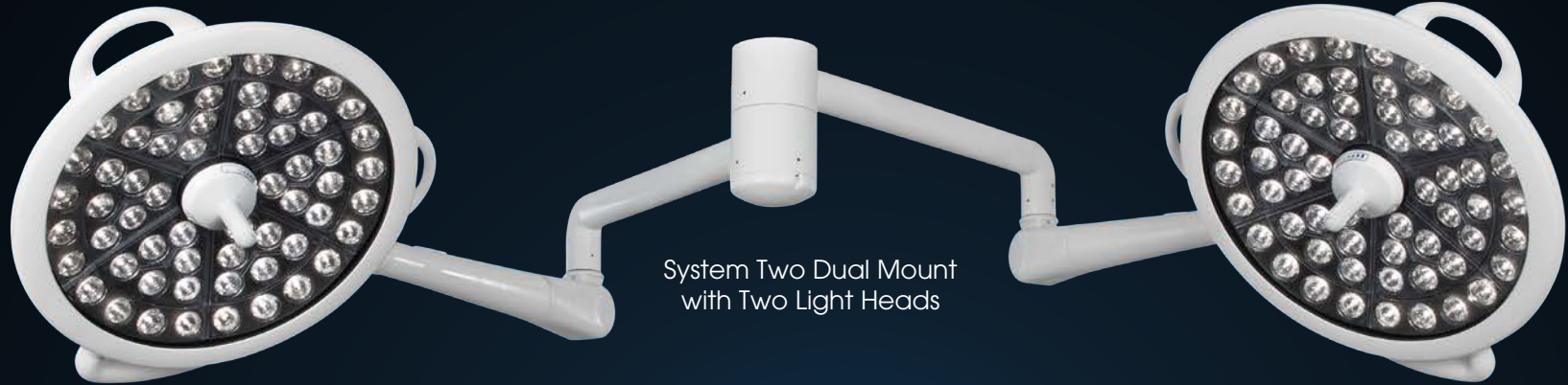
System Two Dual Mount with Two Light Heads