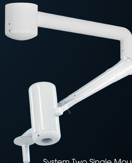
System Two Single Mount with HD Video Camera