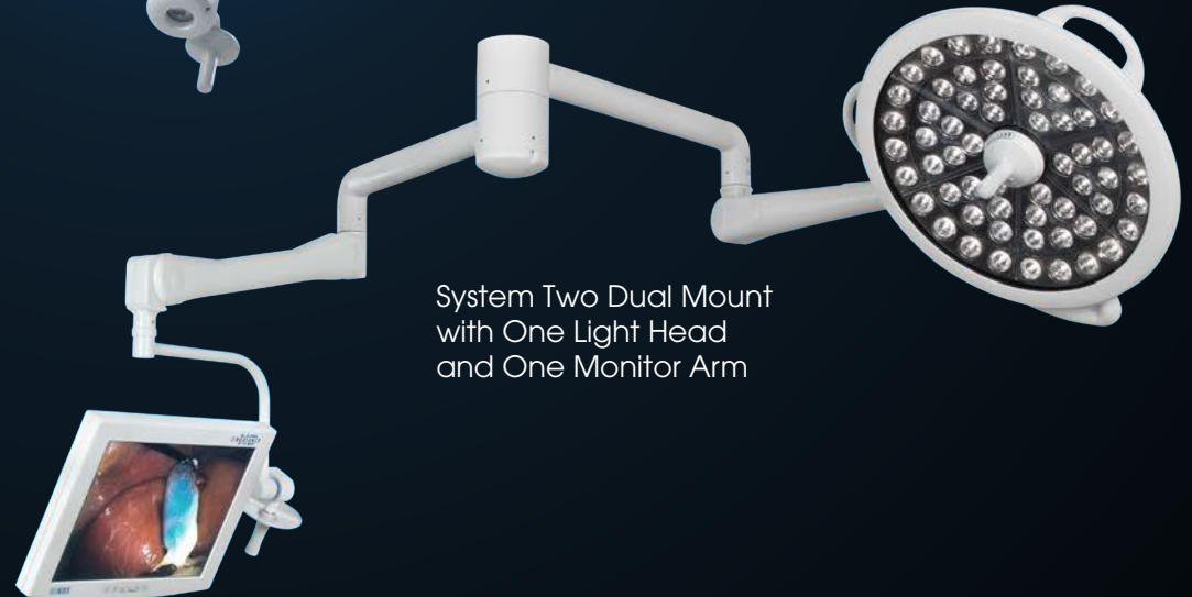
System Two Dual Mount with One Light Head and One Monitor Arm