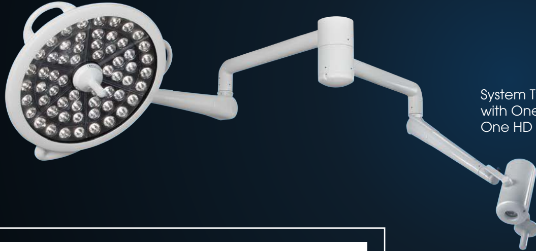
System Two Dual Mount with One Light Head and One HD Video Camera