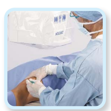
Laser alignment light.