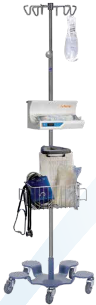
P-1080-6 iSTAND™ shown above with accessories and P-2301-A ivNow

The ivNow® fluid warmer quickly warms and maintains the temperature of injection/intravenous and irrigation solutions prior to their use. The specially contoured warming module cradles solution bags in 0.5-, 1-, 2- & 3-liter sizes. ivNow® units can be customized in the field by stacking or removing pods from the configuration. Units can be used for countertop use or wall mounted with the provided mounting plate.