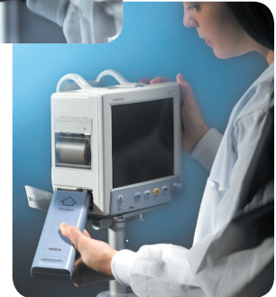
Lithium Ion Battery