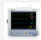
2003 Trio™ Truly compact, portable bedside monitor