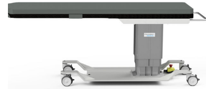
Rectangular Top Table