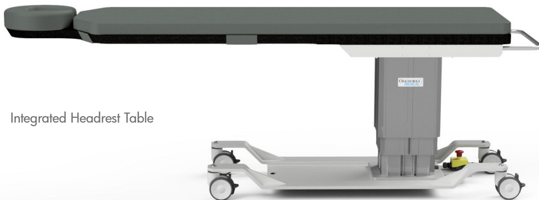
Integrated Headrest Table

Oakworks Imaging Tables have a large height range helping to create safe patient transfers while allowing doctors to stand comfortably. Our large lifting column is very rigid, ensuring rock solid support for fast imaging and procedures. Available with an integrated headrest or rectangle top.